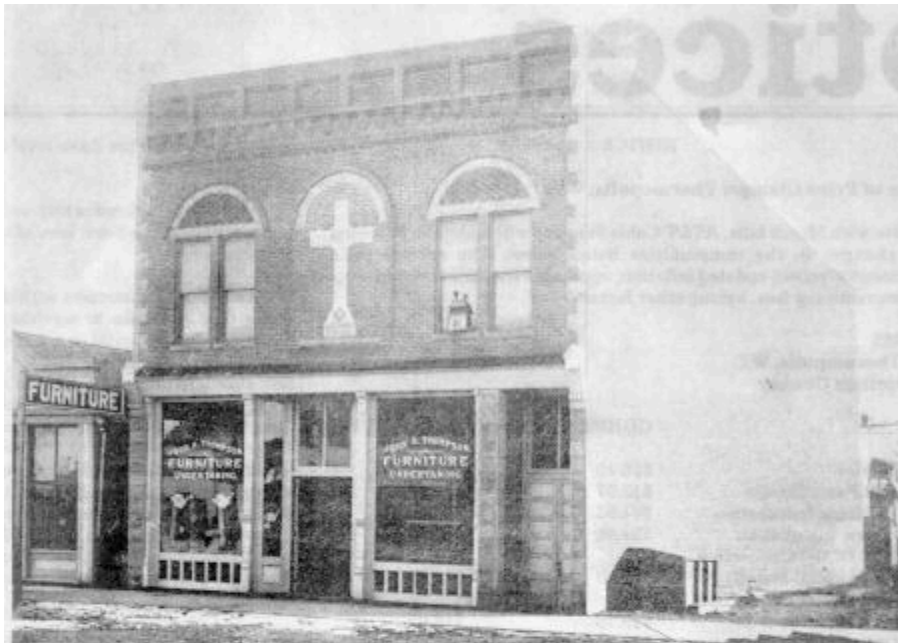
The Masonic Hall on the south side of the 500 block of Arapahoe Street has not changed much over the years. In the early photo, top, courtesy of the Hot Springs County Museum, John A. Thompson ran a successful furniture shop on the lower level and did some undertaking as a sideline. Most of the updates to the building were made in the front entrance, as seen in the lower photo.